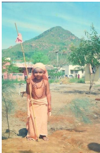
Photo of The Supreme Pontiff of Hinduism whom at the age of 3 when He was initiated into Balasanyas (child saint) and His first Chaturmasya (17 July 1981) by

WHEREAS I convey my best wishes to The Supreme Pontiff of Hinduism (“SPH”), Jagatguru Mahasannidhanam (“JGM”), His Divine Holiness (“HDH”) Bhagavan Sri Nithyananda Paramashivam, recognized as the 1008 th living incarnation of Paramashiva as per Sanatana Hindu Dharma (“Hinduism”) and by His predecessors of enlightened masters and adepts, with their grace and blessings, is celebrating His 41 st Chaturmasya.