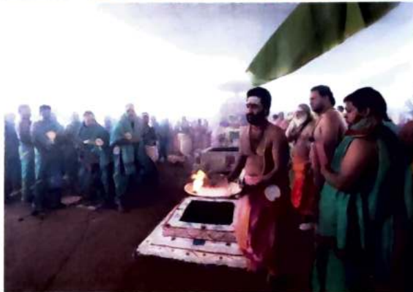
In the second picture above, as part of the ongoing Ati Rudra Mahayaga, aarati (sacred flame) is offered to the kalash (sacred water pots) and to Paramasiva and His Divine Consort Devi, whose faces can be seen