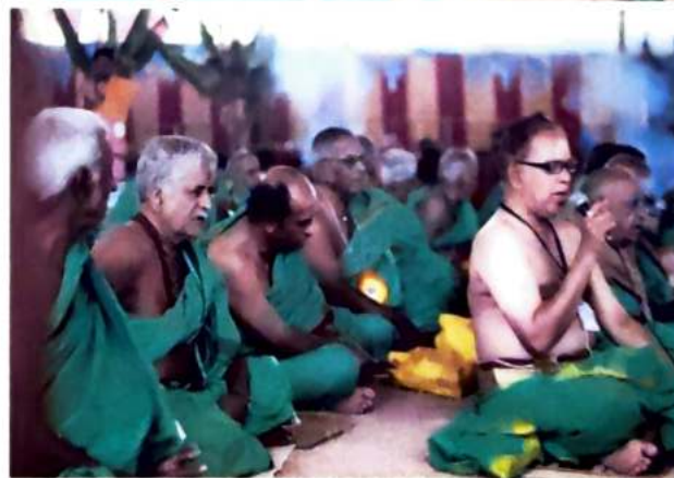
To the loud chants of Sri Rudram, the Ati Rudra Mahayaga is performed