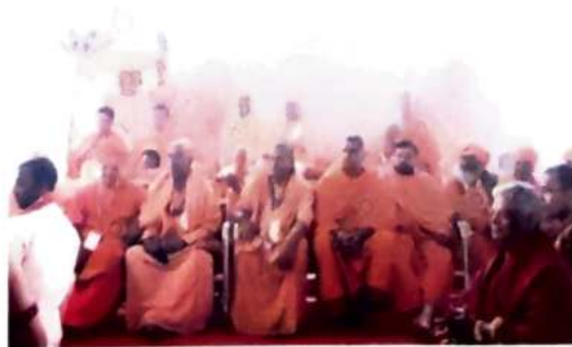
The ceremony is witnessed by all those gathered