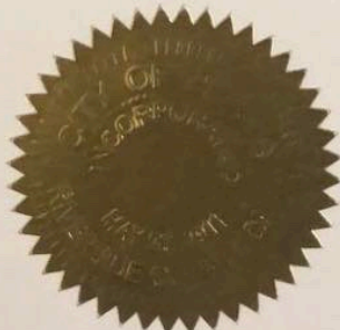
Michael Vargas, Mayor City of Perris, California, USA

NOW, THEREFORE, BE IT RESOLVED , that the Sovereign State of SHRIKAILASA, the Mayor of the City of Perris and City Council hereby proclaim on this 30 th day of August 2022 an agreement to contribute to the cause of world peace and the development of mutual diplomatic relations between the Sovereign State of SHRIKAILASA and the City of Perris.