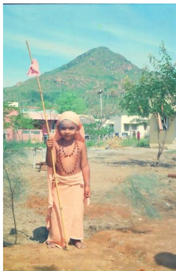
Photo of The Supreme Pontiff of Hinduism whom at the age of 3 when He was initiated into Balasanyas (child saint) and His first Chaturmasya (17 July 1981) by

WHEREAS I convey my best wishes to The Supreme Pontiff of Hinduism (“SPH”), Jagatguru Mahasannidhanam (“JGM”), His Divine Holiness (“HDH”) Bhagavan Sri Nithyananda Paramashivam, recognized as the 1008 th living incarnation of Paramashiva as per Sanatana Hindu Dharma (“Hinduism”) and by His predecessors of enlightened masters and adepts, with their grace and blessings, is celebrating His 41 st Chaturmasya.