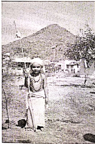
Photo of The Supreme Pontiff of Hinduism whom at the age of 3 when He was initiated into Balasanyas (child saint) and His first Chaturmasya (17 July 1981) by enlightened beings, Gurus and predecessors of The Supreme Pontiff of Hinduism -

WHEREAS I convey my best wishes to The Supreme Pontiff of Hinduism ("SPH"), Jagatguru Mahasannidhanam ("JGM"), His Divine Holiness ("HDH") Bhagavan Sri Nithyananda Paramashivam, recognized as the 1008 th living incarnation of Paramashiva as per Sanatana Hindu Dharma ("Hinduism") and by His predecessors of enlightened masters and adepts, with their grace and blessings, is celebrating His 41 st Chaturmasya.