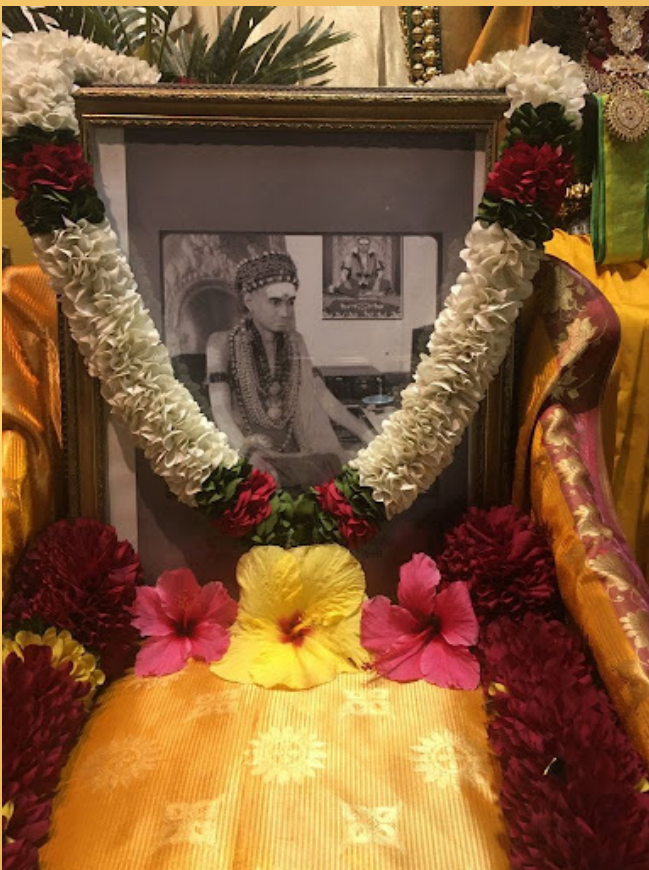
IV KAILASA San Jose