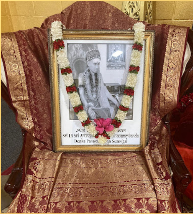
VI KAILASA Los Angeles