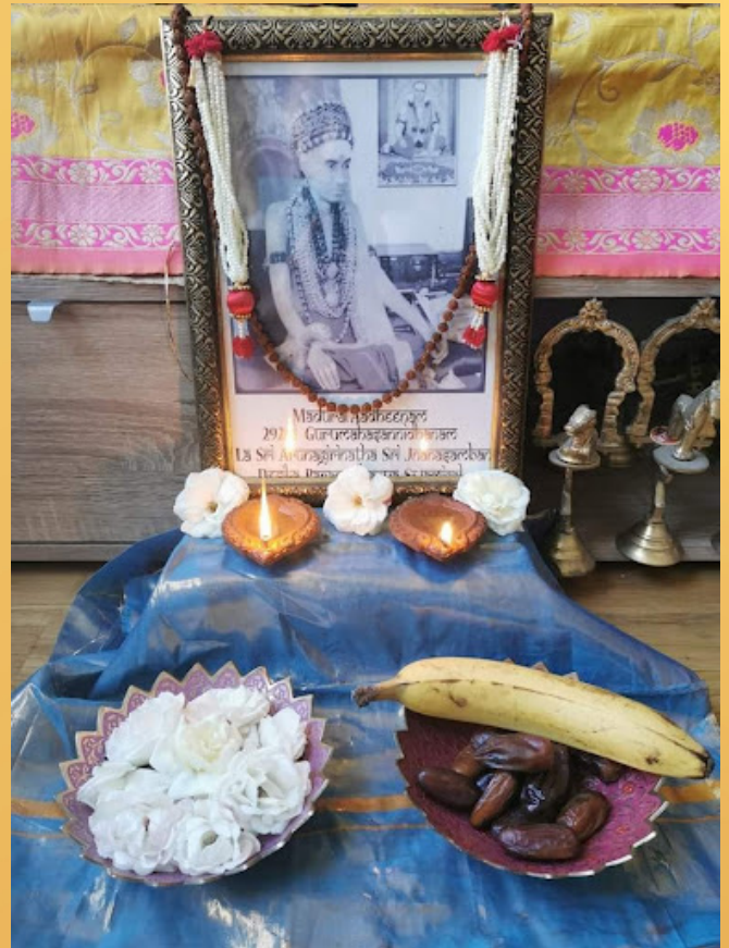
V Paduka Mandir Villeneuve la Garenne, France