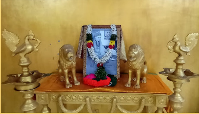
II KAILASA Madurai, Shamapaleetha Sarvajnapeetham