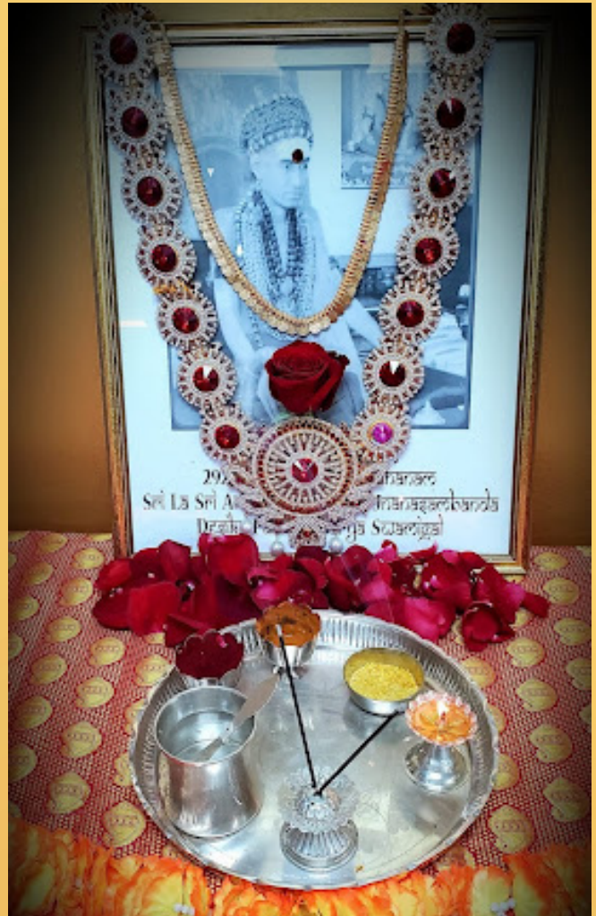
VII KAILASA Houston