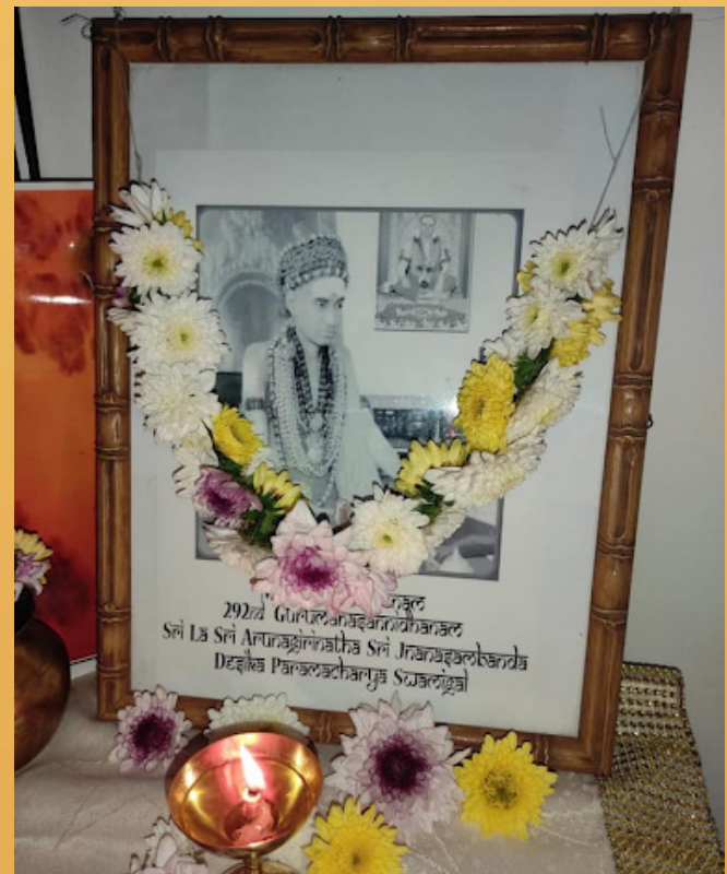
X KAILASA London