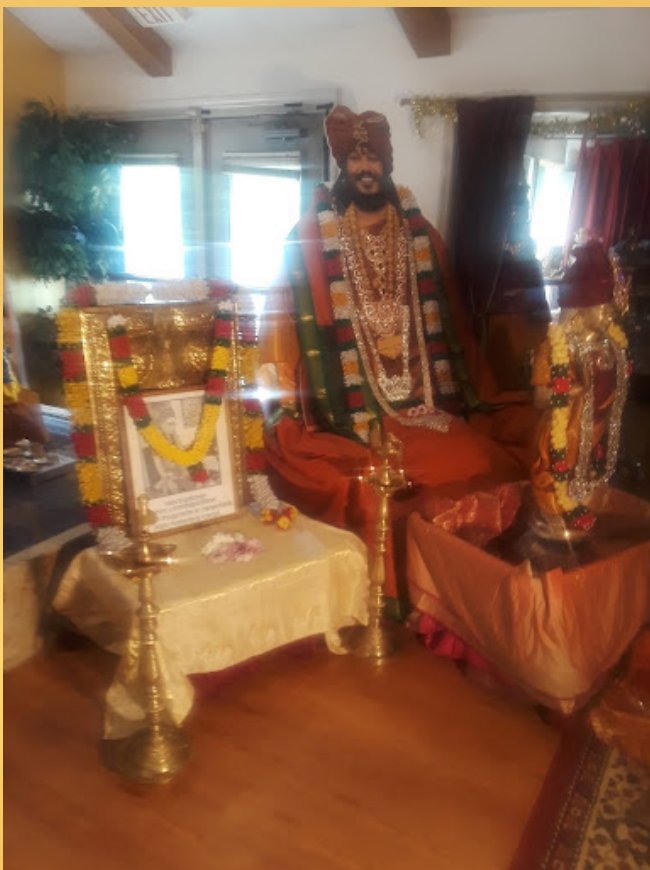
VIII KAILASA Ohio