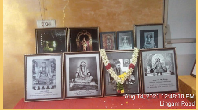
III KAILASA Arunachala Sarvajnapeetham, Tiruvannamalai